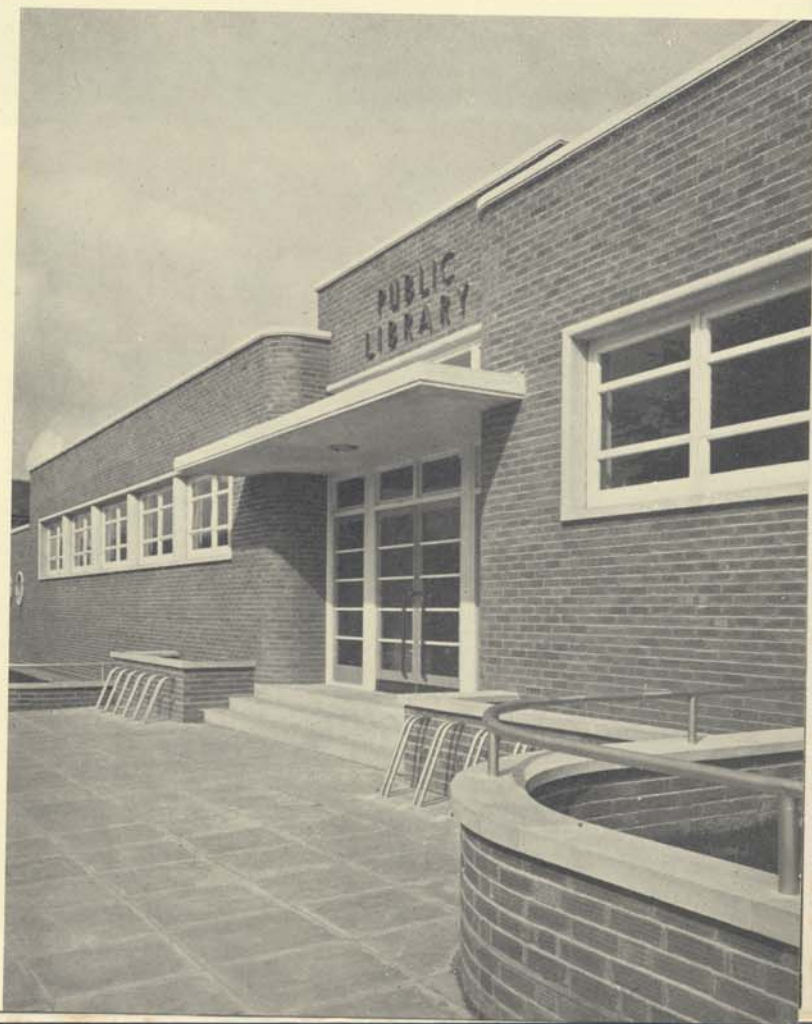
SIDE VIEW OF FRONT ENTRANCE

The Junior Library is suitably arranged and contains approximately 2,000 volumes.